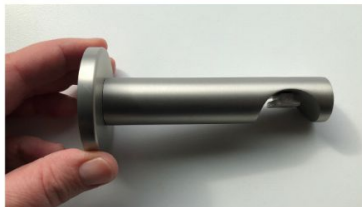
Wall mount bracket