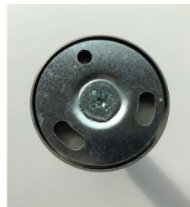
Wall mount bracket base