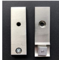
Ceiling mount bracket top (left) and bottom (right)