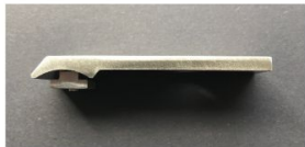
Ceiling mount bracket side view